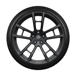
20x9.5-inch Low-Gloss Black Forged Aluminum (WRV) — Included with T/A Package on R/T Scat Pack on Challenger; Included with Dynamics Package on R/T Scat Pack with Shaker Package on Challenger.