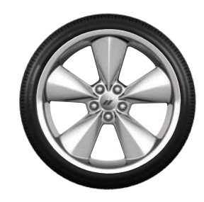
20-inch Classic II Polished Forged Aluminum (WHD) — Included with R/T Classic Package on Challenger R/T.