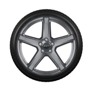
20x9.5-inch Matte Vapor 5 Deep Lightweight Aluminum (WSE) — Optional on SRT Hellcat on Challenger and Charger.