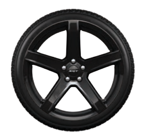
20x9.5-inch Low-Gloss Black 5 Deep Lightweight Aluminum (WEB) — Standard on SRT Hellcat on Challenger and Charger.