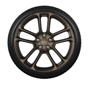
20x9.5-inch Brass Monkey Lightweight Forged Aluminum (WRJ) — Optional on SRT Hellcat on Challenger and Charger.