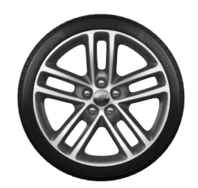
19-inch Polished Aluminum with Dark Pockets (WS1) — Standard on GT AWD on Challenger; Standard on SXT AWD on Charger.