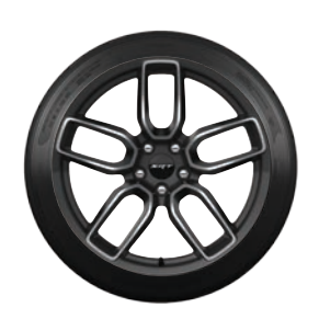
20x11-inch Devil's Rim Forged Aluminum (WSC) —Included with Widebody Package on R/T Scat Pack and SRT Hellcat on Challenger.