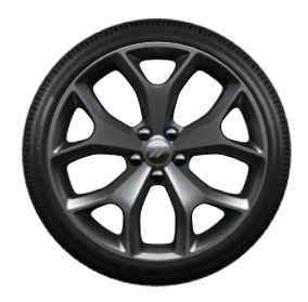
20-inch Granite Crystal Aluminum (WHB) — Standard on GT and R/T; Included with Plus Group on SXT on Challenger and Charger.