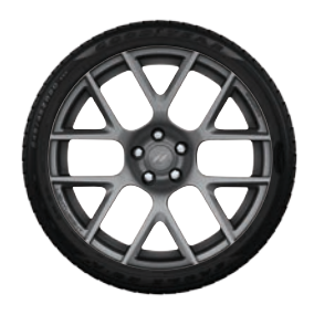
20x9-inch Low-Gloss Granite Crystal Lightweight Forged Aluminum (WRT) — Optional on GT with Performance Handling Group and on R/T and Scat Pack and packaged to the T/A 5.7L on Challenger; Optional on GT with Performance Handling Group and on R/T and Scat Pack; Packaged to Daytona 5.7L on Charger.