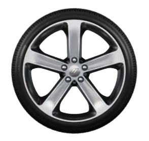
20-inch Polished Aluminum with Black Pockets and Satin Finish (WSN) — Optional on GT and R/T on Challenger and Charger.