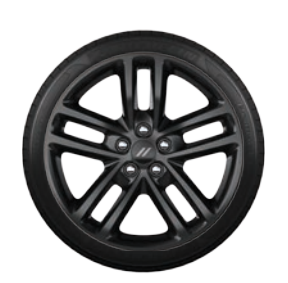
19-inch Black Noise Aluminum (WS6) — Included with Blacktop Package on GT AWD on Challenger; Included with Blacktop Package on SXT AWD on Charger.