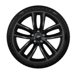
20x9-inch Black Noise Aluminum (WRW) — Standard on R/T Scat Pack; Packaged with Performance Handling Group on GT and R/T on Challenger.