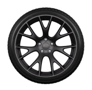
20x9.5-inch Low-Gloss Black Lightweight Forged Aluminum (WH3) — Included with Performance Plus on R/T on Charger; Optional on SRT Hellcat® on Challenger and Charger.