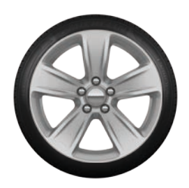
18-inch Satin Carbon Aluminum (WK1) — Standard on Challenger SXT.