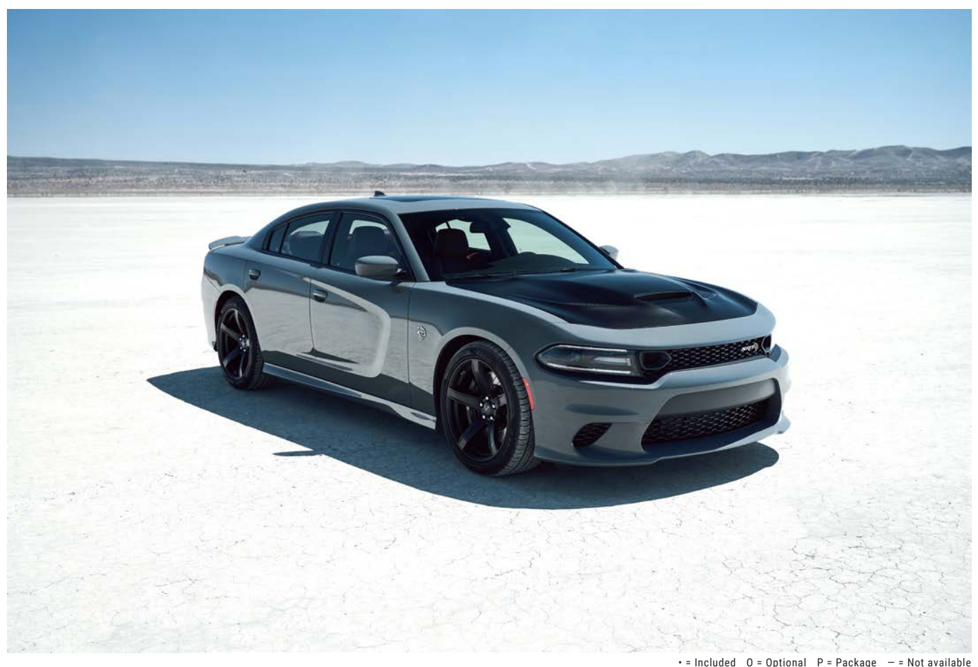
• = Included O = Optional P = Package