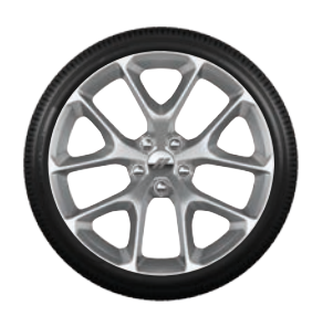
20-inch Satin Carbon Aluminum (WPZ) – Included with Plus Package on GT and R/T on Challenger and Charger.